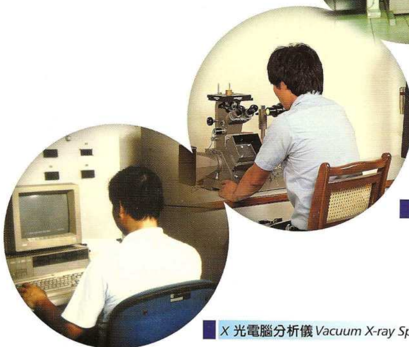
X 光電腦分析儀 Vacuum X-ray Spectrograph